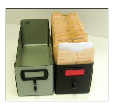
Grey MT/57[G] & Black MT/57[B]